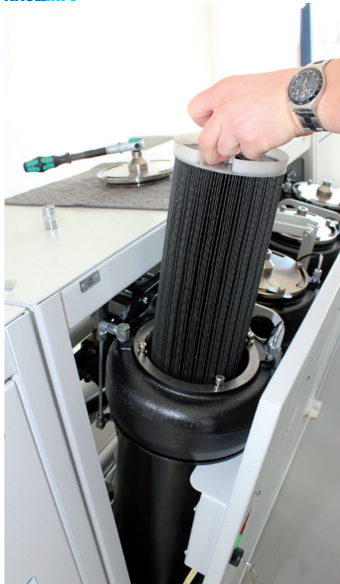
The core element of KNOLL MicroPur ® superfine filters is the filter cartridges that are regularly backflushed in an open-loop system. In case of wear, they can be replaced cleanly and in a very short time.

flushable filter cartridges. Handling the filter aids requires additional peripheral equipment. These requirements include the bag infeed, the automated and protected system for emptying the bags so that dust does not escape, fulfillment of legal explosion protection directives, and the required agitator for fluidization of the auxiliary medium that has to be applied as uniformly as possible to the filter cartridges. The system (complete with peripheral equipment) requires a larger installation space than a comparable system with backflushable filters.