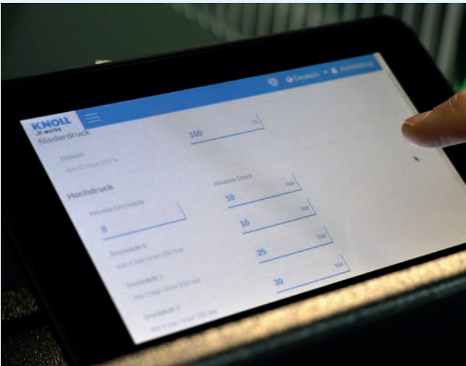
The SmartConnect control panel allows the operator to select the pressure level easily and quickly.

The target object was a Mori Seiki NV5000 machining center, which is a good ten years old and is used for demanding milling and, above all, drilling operations. Kirchhof had already retrofitted it eight years ago with a small high-pressure pump including a cartridge filter. "At the time, that was an urgently needed and therefore quick decision - and it also worked", Tobias Kirchhof confirms, qualifying his statement by saying: "But with quite little convenience and a wide variety of difficulties". The high-pressure pump, for example, was designed too weak and did not reach the necessary pressure. In addition, the filtration was poor and did not correspond to Kirchhof's quality standards. "The noise during the operation of the high-pressure unit was also decidedly unpleasant. Especially for me, since my office is located in the immediate vicinity of the machine", mentions Tobias Kirchhof. Asked about the long time that has passed since then, he says with a grin: "Emergency solutions often have that about them. They stay longer than originally planned".