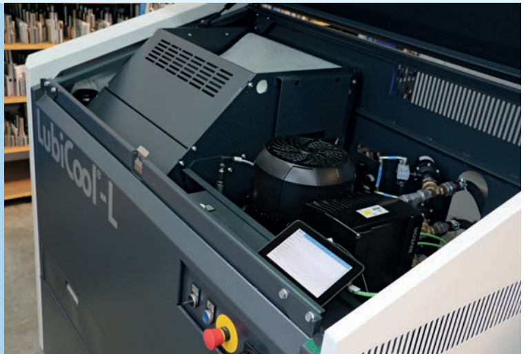
KNOLL's new SmartConnect control concept makes LubiCool®-L easy and intuitive to operate. The 7" control panel is located protected under the (usually closed) cover.