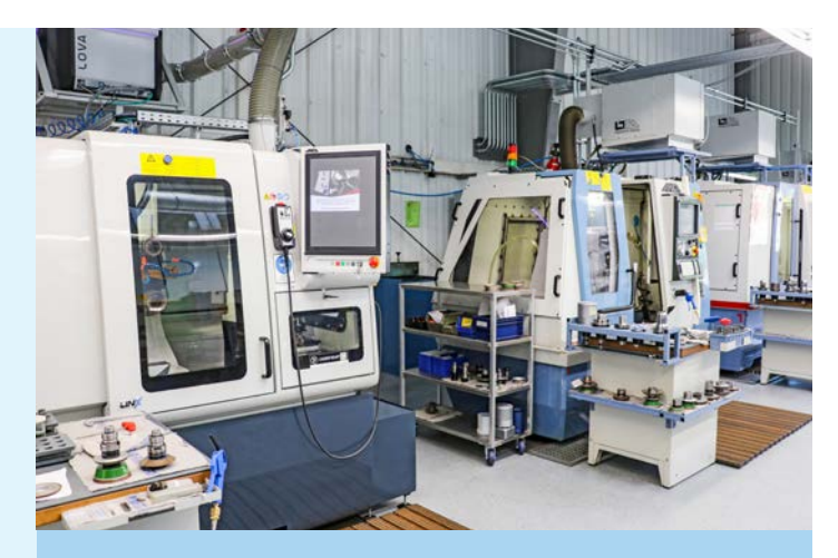
Currently, six 5-axis tool grinding machines are connected to the KNOLL central system.

we could then provide additional machines and at the same time bring the oil and chip management up to the latest standards.