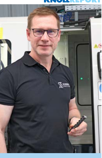
working at full load."

operation. This ensures a very constant filter performance, which ensures high process reliability during grinding."