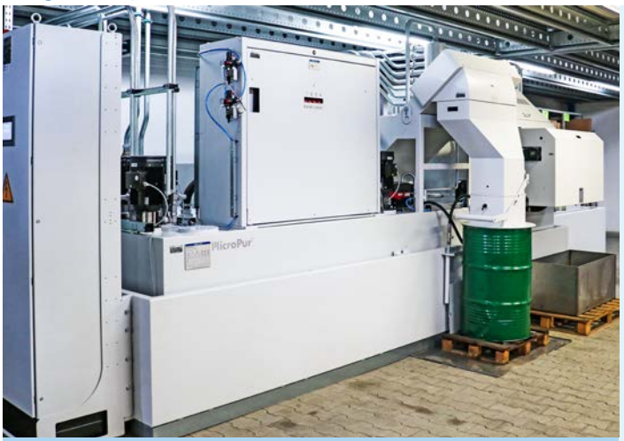
Works perfectly: The KNOLL central system at Schnebelt Präzision consists of a KF-E compact filter (at the back), a MicroPur® ultrafine filter (in the foreground), automatic concentrator (with green drum) and a cooling unit (not in the figure). The compact filter (in the background) ensures dry chip discharge. From the automatic concentrator, the carbide sludge falls into the green drum, largely sorted by type.

came to reorganizing the production area in 2020 and in finding the optimum central system for cooling lubricant cleaning and sludge processing.