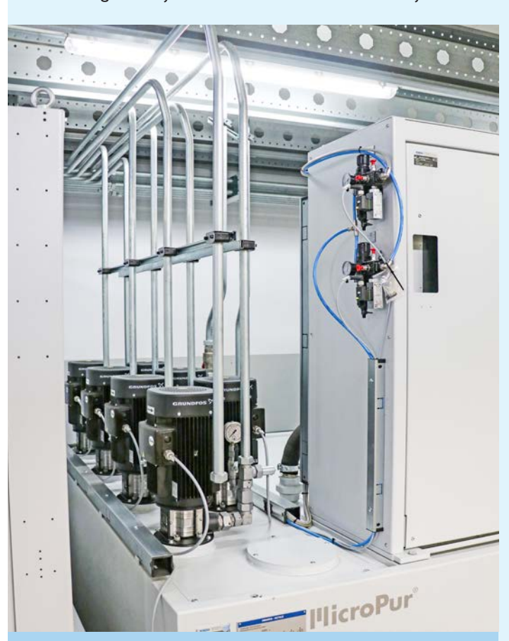
A special request: Unlike the classic central systems, Schnebelt Präzision assigns a clean oil pump with a separate supply line to each grinding machine.

The backflushable filter cartridges used for mixed machining are specially designed for this machining process, so that again supported by the filter cake that builds up - the filter quality is less than 5 µm at the end. "With pure carbide machining, a filter fineness of up to 1 µm is achieved with specially designed filter cartridges," mentions Joachim Gruß. He points out other positive features of the MicroPur®: "Thanks to its special design, it does not require any filter consumables, which contributes to its high cost-effectiveness. The filters are gradually backwashed while the entire system is in