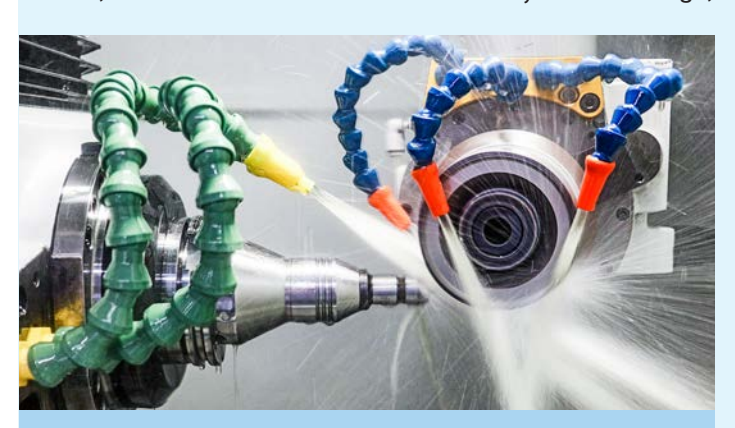
Thanks to perfect oil quality, Schnebelt Präzision achieves improved grinding results. The service life of the grinding wheels has also increased with the new central system.

When, due to the growing number of orders, the capacity of the five machines reached its limits despite three-shift operation, the solution was that the two central systems had to go;